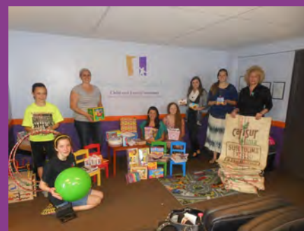
Donation from the Warren Junioresettes for the Social Skills Group.